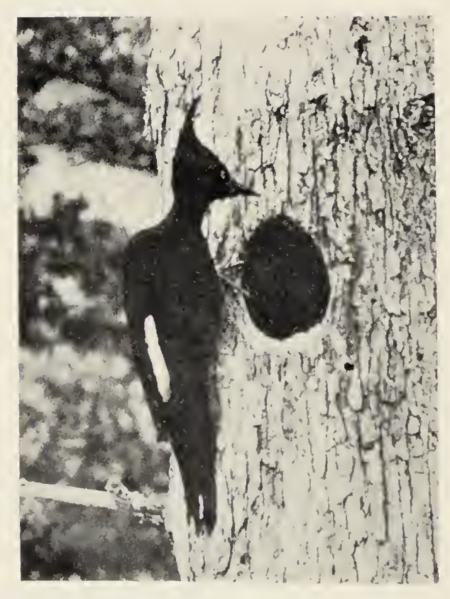
FIG. 2. Female Magellanic Woodpecker at nest cavity; mate of male depicted in Figure 1.